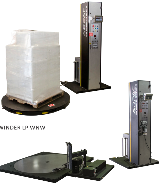
SIDEWINDER LP WNW