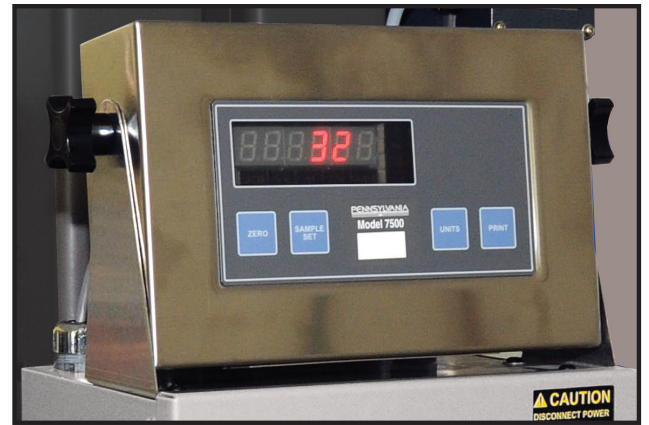
WRAP-N-WEIGH® Operator Controls